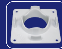
Porch Post Plate