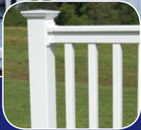
"T" Rail Top 2" x 3 1/2" Bottom 1 1/2" x 1 1/2" Pickets